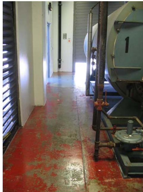
(Top) Wet, epoxy-coated flooring created an unsafe working environment.

Plant personnel were trained in the application of the Loctite® Big Foot™ products, and hands-on application support is always available from Henkel. According to the plant manager, by having their own team trained in application, they are able to increase safety and drastically reduce cost by coating other areas of the plant as needed.