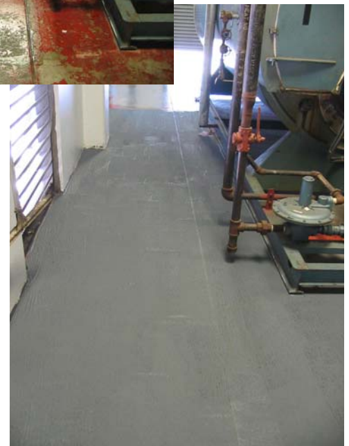
(Bottom) After applying the Loctite® Big Foot™ Anti-Slip Flooring product, this flooring is now skid-proof, even when wet.

USA Henkel Corporation 1001 Trout Brook Crossing Rocky Hill, Connecticut 06067 Tel: 860.571.5100 Fax: 860.571.5475