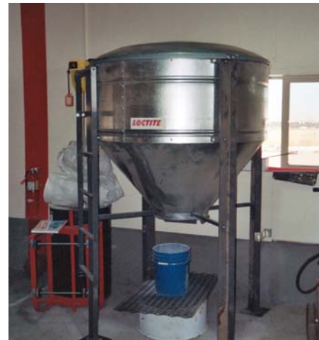
Loctite® Fixmaster® Magna-Crete® is available in 1 gallon and five gallon kits (below), as well as the 2,750 Super Sack, which the Idaho DOT dispenses with a grain hopper (above).

According to the Idaho Transportation Department Maintenance Specialist, “The ability to get traffic back on a repaired roadway quickly is a great benefit to public transportation, and a stress reducer for the local transportation department.”