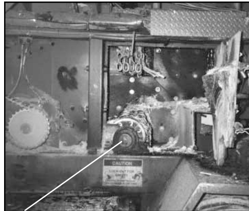
Loctite® 222 Threadlocker seals shaft and bearing engagement of flail drum chipper (see below) in the field, providing easy servicability without fire threat.

Loctite 222 has provided for easy serviceability of the chipper unit in the bush without threat of fire outbreak.