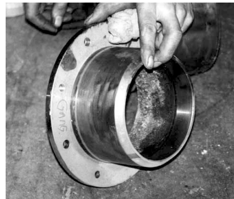
The inner race of the roller bearing housing typically wears after only 6 months of use and costs approximately $600-$800 to replace. Loctite® RC™ 680 Retaining Compound extends the life of the fit between the housing and the bearings to over two years.