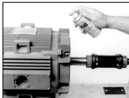
Held firmly in place by Depend Adhesive, the mounting pad will enable the sensor to provide accurate readings of the equipment's condition.

Located in Knoxville, Tennessee, CSI serves leading maintenance-conscious organizations. Because of their positive experience with Depend, CSI offers a Loctite adhesive in its custom-mounting kits.