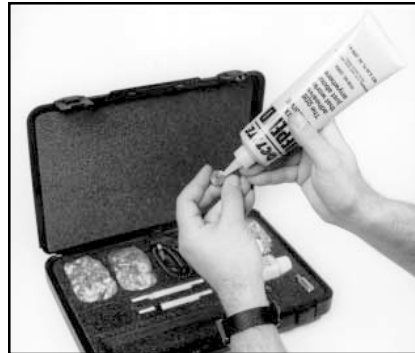
Depend No-Mix Adhesive is applied to the sensor.

Computational Systems Incorporated (CSI) is in the business of proactive and predictive maintenance—finding and solving problems with vibrating or rotating machinery. One of CSI's major tests—vibration analysis—predicts when a certain machine or component is in the danger of failing. This analysis involves a sensor mounted on the machine to measure frequency response, the basis for vibration analysis. In this operation, a mounting pad to hold the sensor is attached to the machine by means of an adhesive. CSI tried a number of adhesives to hold the mounting pad, but none provided the necessary combination of adhesion and vibration resistance.