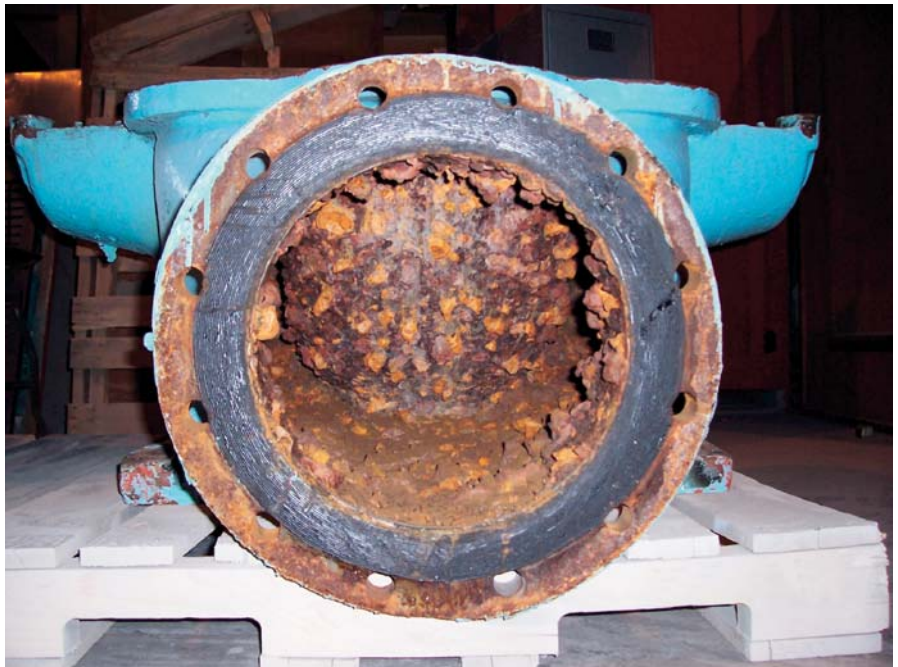
Figure 1. Pump interior with severe tuberculation

Through computerized modeling of its water distribution system, the MCWA discovered many discrepancies in their pumps between the original manufacturer pump curve and the actual field pump curve. When inputting the pump curves into the model, they discovered that the model could not be calibrated using original manufacturer pump curve data. The MCWA staff went into the field and