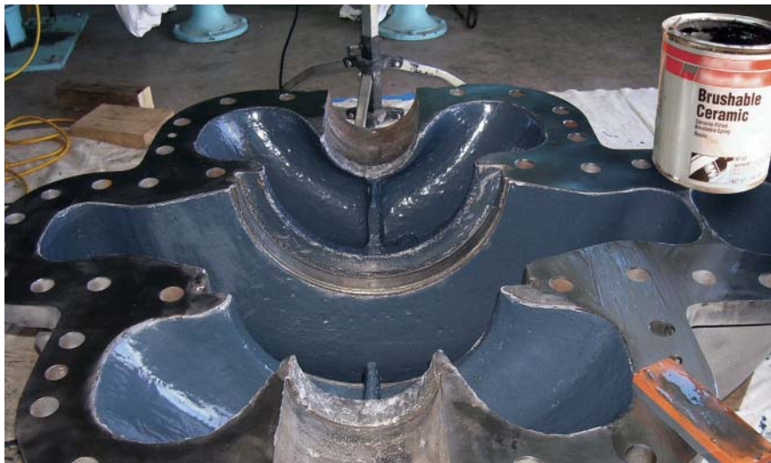
Figure 2. Pump interior after coating with brushable ceramic epoxy

The MCWA team began a pilot study to refurbish several interior casings of the mechanically rebuilt pumps to see if reducing interior pump roughness would have any positive impact on pump performance and efficiency. Since only sandblasting the interior pump casings would allow corrosion and tuberculation to return quickly, the team began looking for acceptable coatings that could be applied after sandblasting to protect the interior surface from future corrosion and perhaps even enhance the reduction of head loss/hydraulic drag through the pump.