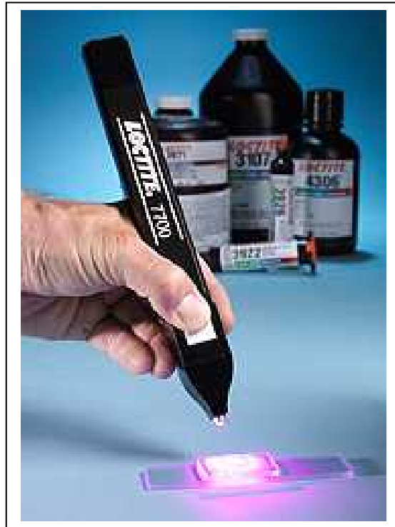
Figure 3 – Handheld High Irradiance 405 nm LED based Light Source